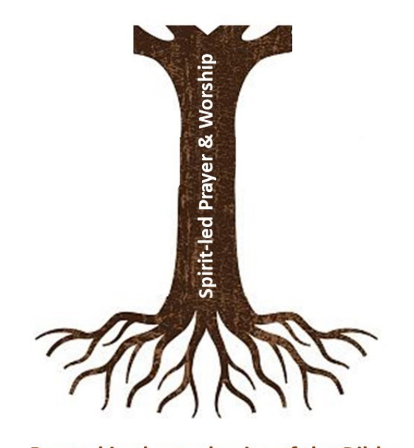
Rooted in the authority of the Bible, with Jesus central in all we do.

He also designed and controls all things invisible; we can only scratch the surface as we study the laws of physics, biology, astronomy etc not to mention the vastness of the spiritual, unseen energy forces that exist all around us. He is the one and only ever to come through death as the first born from the dead. No super-good person, no spiritual guru, no founder of any religion or movement, no dictator or any ruler, however powerful has ever defied death. Only Jesus has supremacy in all things. Only in Jesus is the fullness of God replicated by which he is able to reconcile all things to himself and bring humanity into the presence of God and the presence of God into the centre of each life that acknowledges him as the Son of God who came into the world.